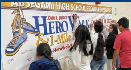
Absegami High School Future Business Leaders of America promotes the HERO Walk and HERO Pledge.