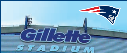
Hundreds of New England Patriots fans take the HERO Pledge during home games. This is an important program for Gillette Stadium because a high percentage of fans drive to the games.