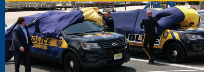
The HERO Campaign kicked off Memorial Day Weekend by unveiling the newest HERO-wrapped patrol cars. Presently, eleven HERO police cars patrol the streets of south Jersey serving as rolling billboards. A twelfth is in the works.