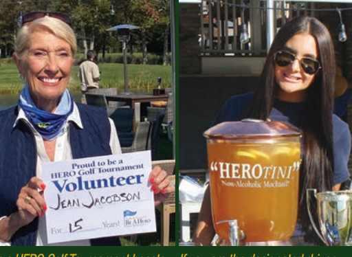
The Be a HERO Golf Tournament boasts some of the most dedicated and hard working volunteers. Thank you!