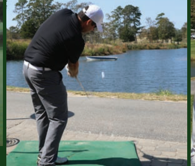
The Gus Tzaferos Tin Cup Challenge is always one of the highlights of the tournament. Golfers compete to drive a ball into a boat floating in the lake and have it stay in the boat.