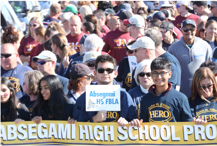
Students from area high schools showed their support

More than 300 friends, victim families and supporters from throughout South Jersey turned out for the 13th Annual HERO Walk to honor the memory of those we have lost and promote the use of designated drivers to prevent future drunk driving tragedies.