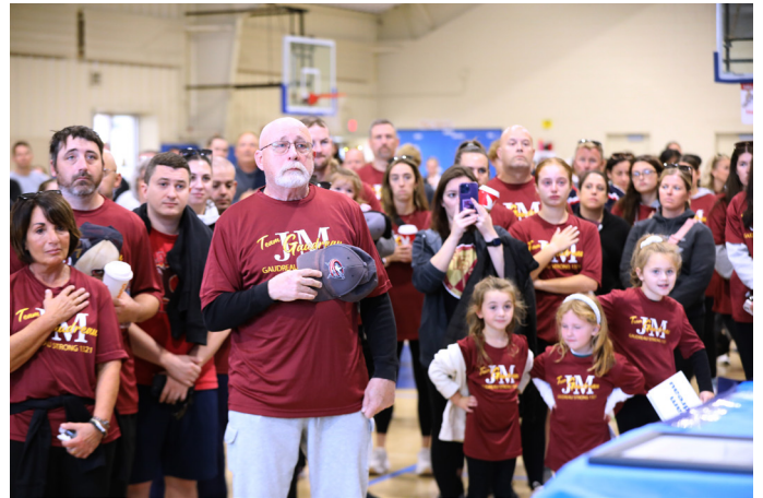
Friends and families pay tribute to the memories of lost loved ones