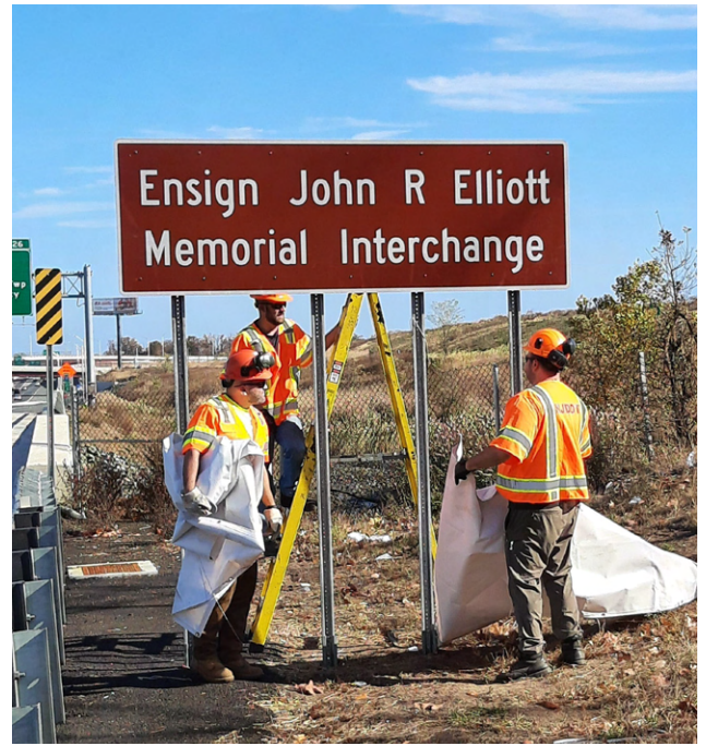
The new Ensign John R. Elliott Memorial Interchange makes traveling from I-295 to the Jersey Shore faster, easier, and safer

According to the State Police, 24,000 cars are impounded annually under John's Law.