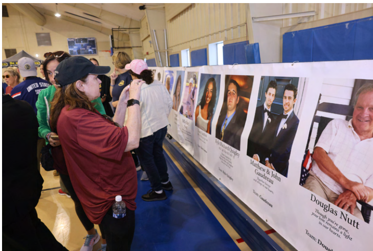
Families gather around the pictures of loved ones at the Memory Banners