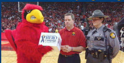
University of Louisville "Cardinal" supports HERO