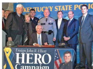
Kentucky Governor Steve Beshear recently launched Kentucky's HERO Campaign for Designated Drivers, encouraging people to participate in designated driving programs throughout Kentucky and the nation.

Frankfort, KY - To promote the program, HERO will partner with the Kentucky Office of Highway Safety, the Kentucky State Police and the Kentucky Dept. of Alcoholic Beverage Control. HERO posters, billboards, radio and television ads will be used throughout the state, to promote the campaign's message, "Be a HERO. Be a Designated Driver®."